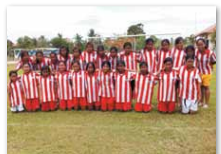
The Cambodian Under13 National Team in the strip supplied by Northbridge FC.