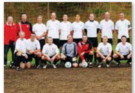
Over 35 Mens Division One KDSA Winners.