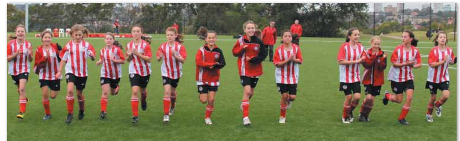
Under12 Football NSW Super League Premiers.