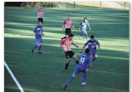
2011 Achievements Football NSW Men Best Player, Best Goal Keeper, Best Coach.