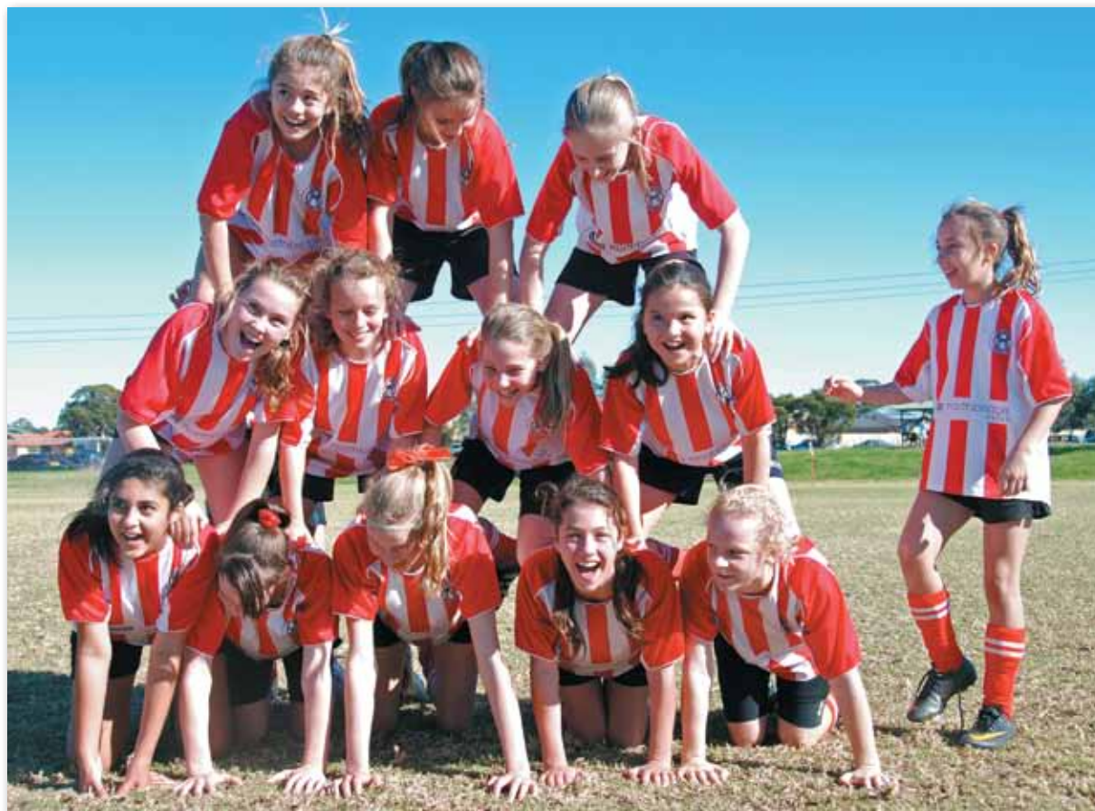
2011 team photo competition runner up, Under12A girls.