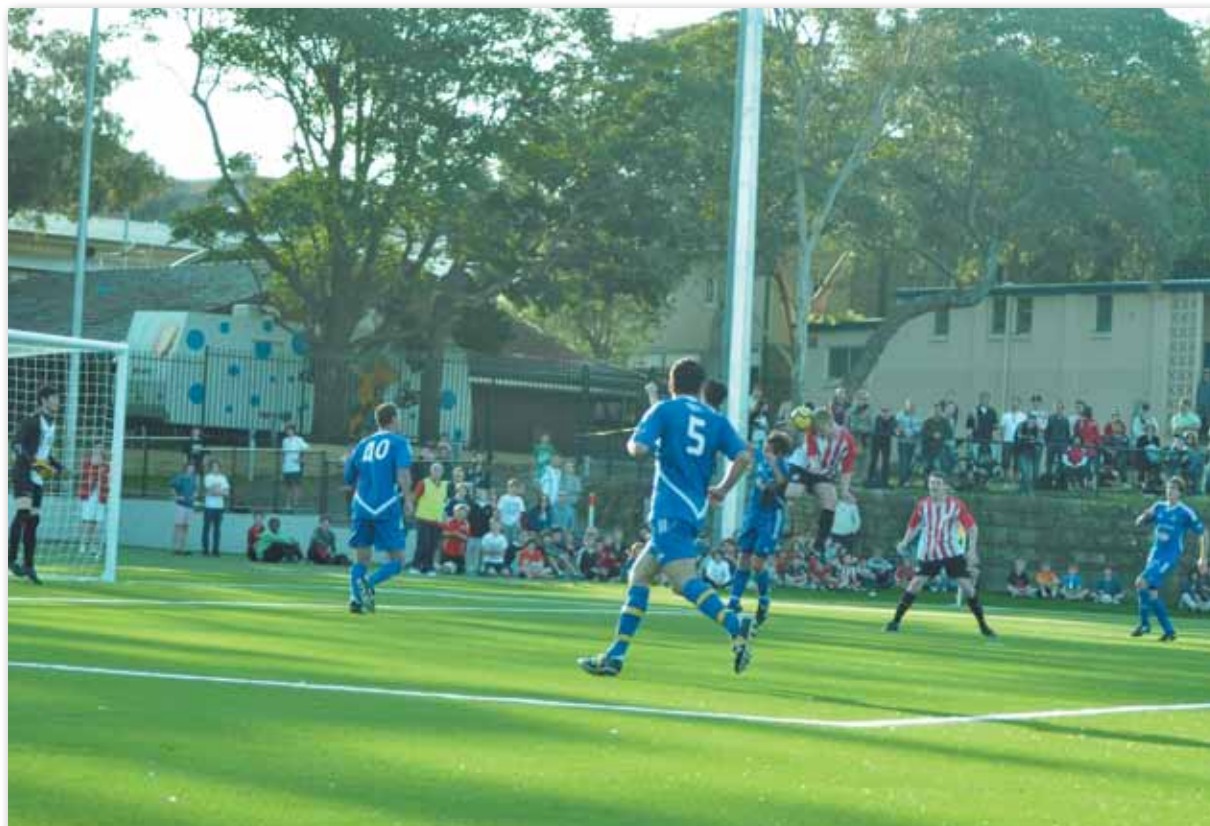
1,000 spectators saw Elliot King score the goal that took Northbridge into Football NSW Division One. Northbridge Oval.

Northbridge FC Junior Football Academy. Club objective is to be a leading club in Australia in youth development. 125 kids between u8 and u12 training 3 times a week over 40 weeks in accordance with the FFA National Curriculum.