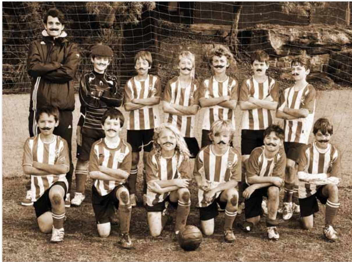
2011 team photo competition winner, Under12A boys.