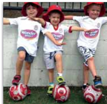
Football for all. Bilbys for 3-5 year olds.