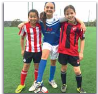
Local Clubs join forces to grow girls football with combined Welcome to Football days.