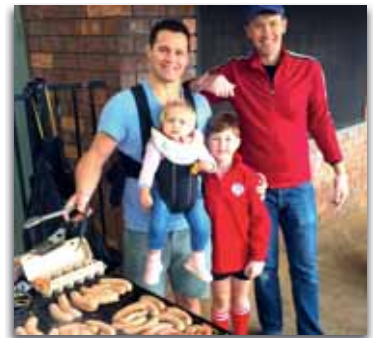
We love our volunteers. Plus proving men can multi-task, baby and barby no worries.