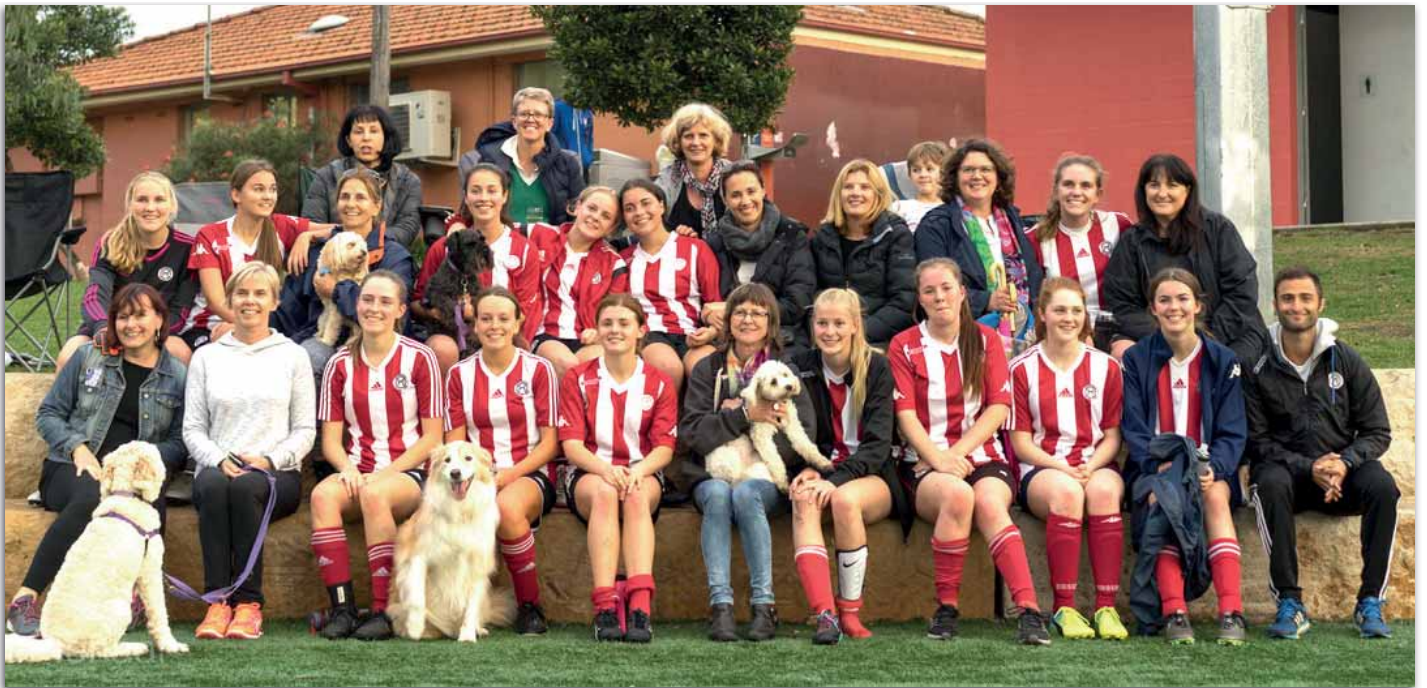
Mothers Day 2017. Northbridge WAA C. Division 2 winners.