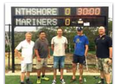
New scoreboard goes in, well done gentlemen.