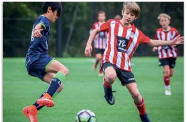
Thanks Norths for your continued support of Northbridge FC and grassroots sport.