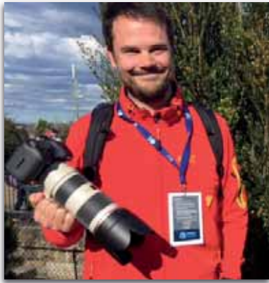
Thanks to all our photographers. Special thanks to Toby Lord for all your great pics and graphics.