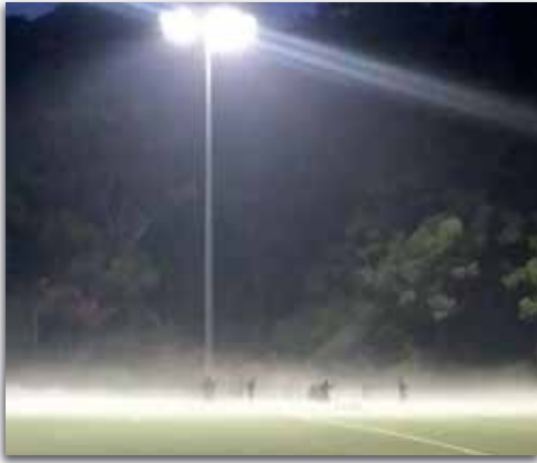
Early morning training, Blackman Park. Ouch!