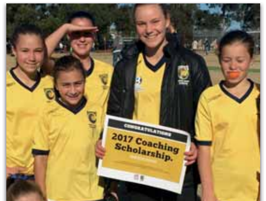
Thanks Commonwealth Bank for sponsorship of the Girls Program in 2017.