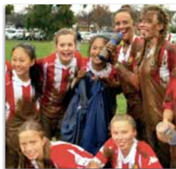
Kanga Cup fun, just add mud!