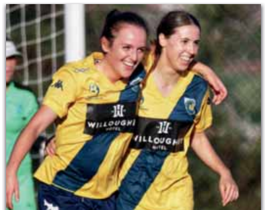
Thanks Willoughby Hotel for your ongoing support.