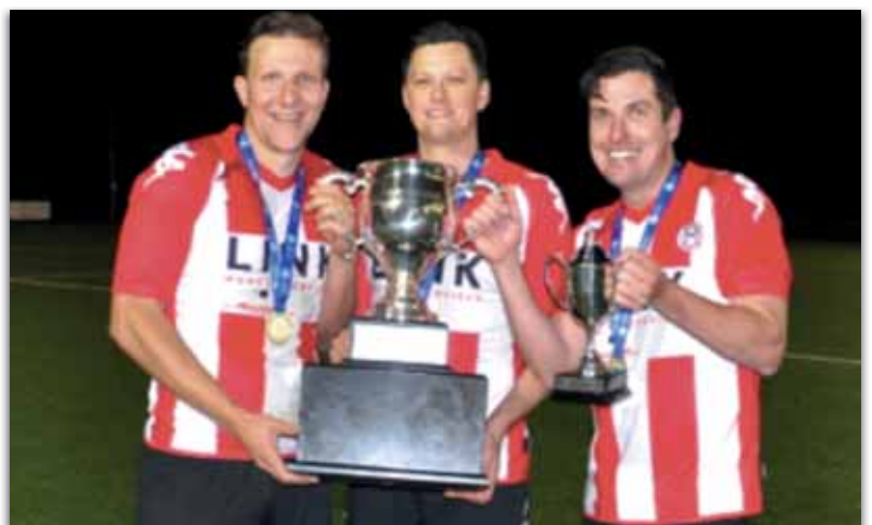
Northbridge Men, FNSW State Cup winners and promoted to NSFA Premier League.