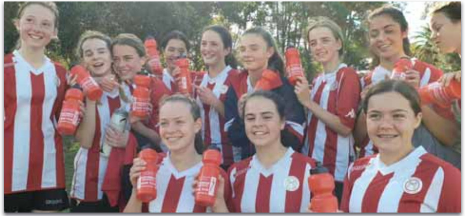
Thanks Northbridge Dentists for your support. [ And all those water bottles. ]