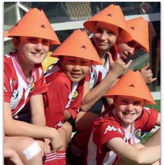
Thanks Northshore Volkswagen for your ongoing support.