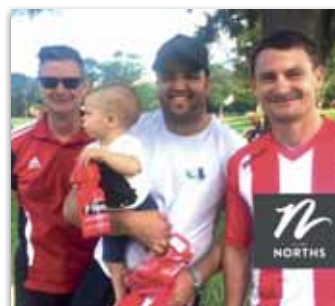
Northbridge FC, the family football club.