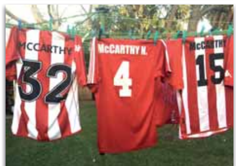
Northbridge Football Club. Sailors Bay Road. Northbridge. PO Box 4093. Castlecrag. NSW. 2068