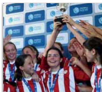
Under 16 Northbridge Girls. Football NSW State Cup and Champion of Champions Winners.